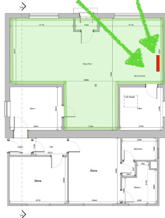
IONA CRAFT SHOP - SHOP INTERIOR AND DISPLAY AREA